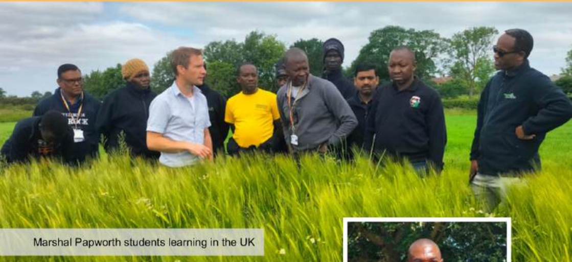
Marshal Papworth students learning in the UK