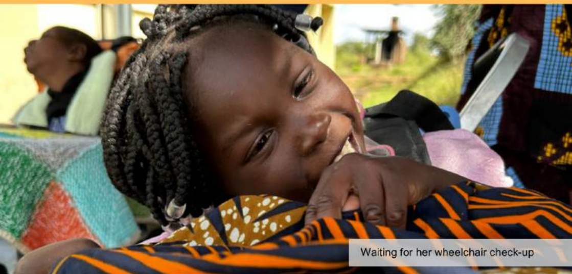
Waiting for her wheelchair check-up