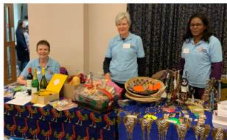
Pictured above: Volunteers helping at our 30 th Anniversary celebration event.

In 2024, we were supported by 40 dedicated individuals who volunteered remotely and in Monmouth, contributing in a wide range of ways – from creating a film for our 30th anniversary to running coffee mornings, helping in the office, and supporting decision making in meetings.