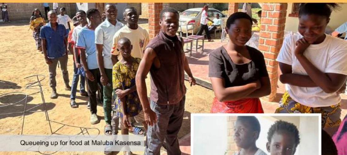
Queueing up for food at Maluba Kasensa