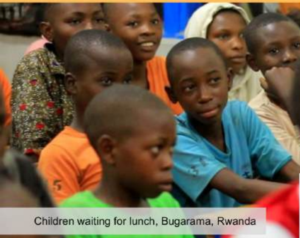
Children waiting for lunch, Bugarama, Rwanda