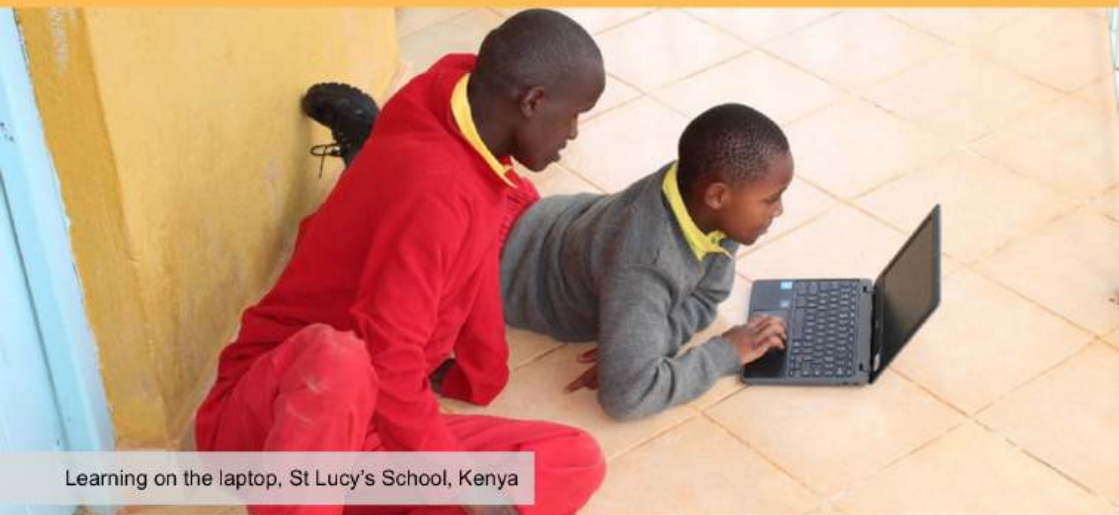
Learning on the laptop, St Lucy's School, Kenya