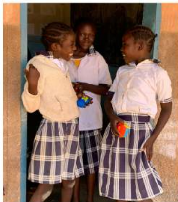
Students at Kasenga School

163 children were registered with the Zambia Agency for Persons with Disabilities and issued ID cards, giving them access to national social support.