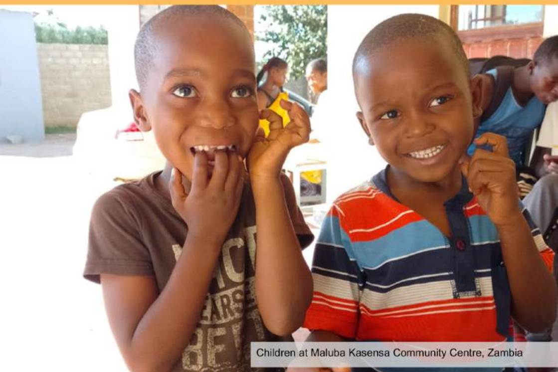
Children at Maluba Kasensa Community Centre, Zambia