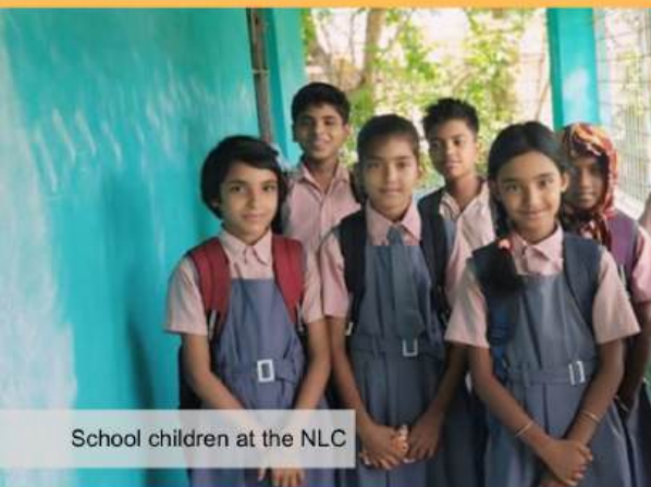
School children at the NLC