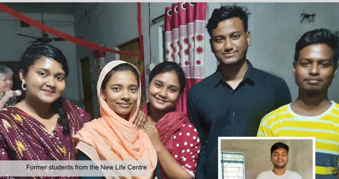
Former students from the New Life Centre

Hands Around the World's partner in West Bengal, India is the New Life Centre (NLC), a school and vocational training centre which currently supports over 250 children and young people towards qualifications that will improve their prospects for further education and employment.