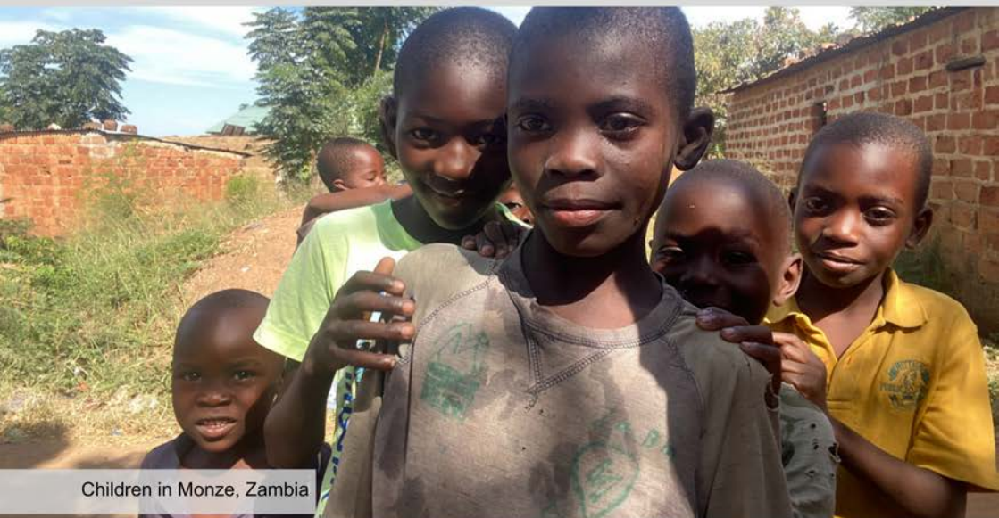
Children in Monze, Zambia