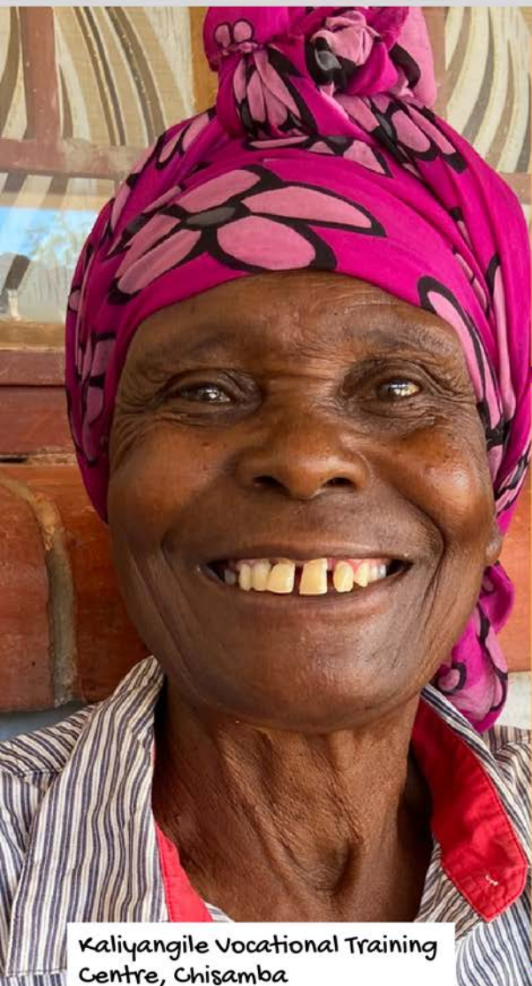
Kaliyangile Vocational Training Centre, Chisamba